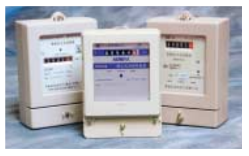
Typical Chinese meters using latest single IC technology.

Motorola's PowerCom, use highly accurate integrated digital solutions to dispense electricity to residential consumers. In addition to prepayment strategies, digital energy measurement technology holds real promise in North America as a strategy for remote data collection. Refurbishing classical energy meters with electronic boards for data collection has proved useful in the short term, but the additional cost associated with this strategy seems unnecessary when other options are available. An alternative to such a solution could be allowing a dc power supply for the electronic retrofit to be shared by a single integrated circuit that measures watts and eliminates the components required for displaying energy. A meter without a display, although unusual in most of the Western Hemisphere, could offset the additional unit cost of a module for remote data collection.