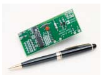
Actual size of a single IC kWh measurement base unit.

The most popular single-phase digital meter being installed in China looks