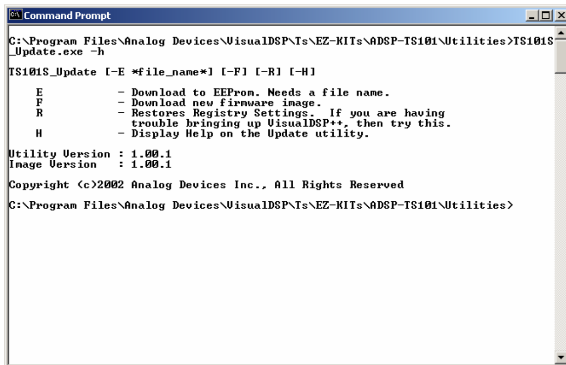
Figure 2 : Command Prompt Window 1

Notice that the "R" option is used to restore registry settings.