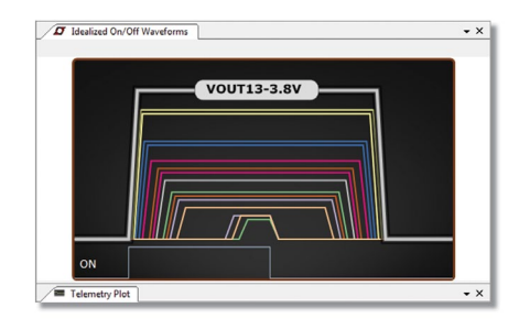
Free Software Download www.linear.com/LTpowerPlay