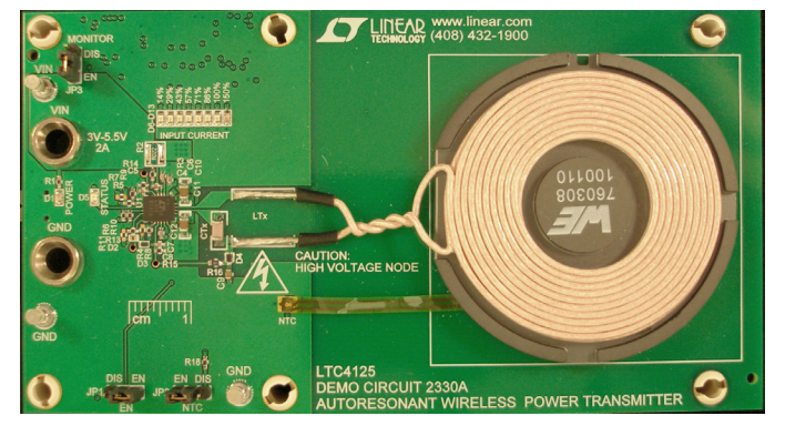
LTC4125 DC2386A/B Demo Kit Transmitter Demo Circuit