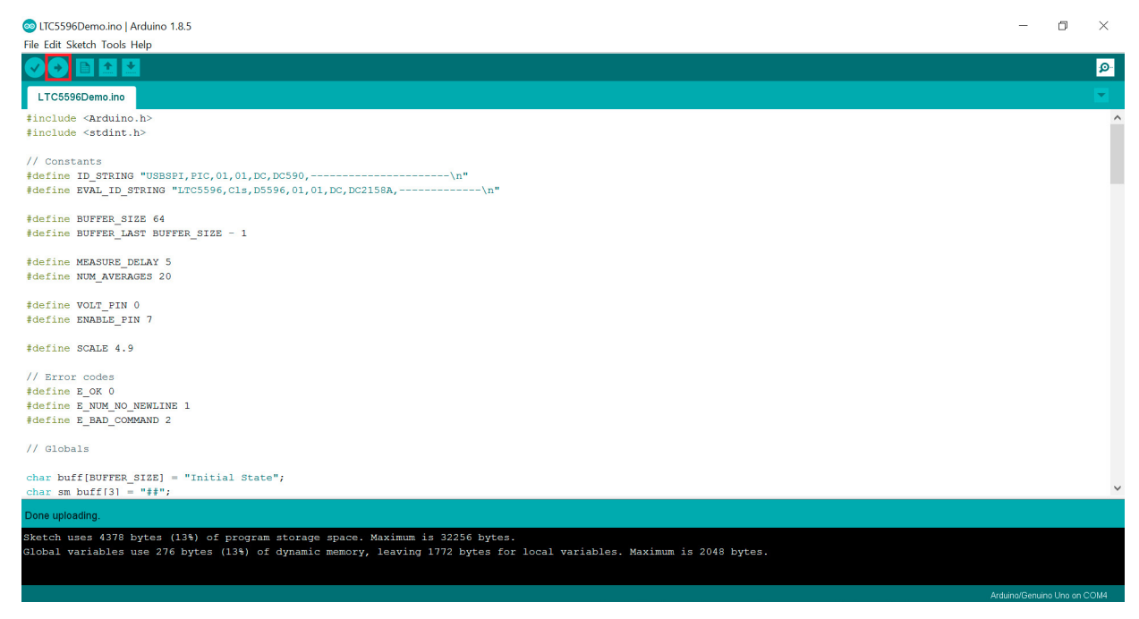
Figure 2. Firmware Re-Load (Only If Necessary)