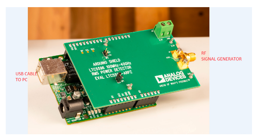
Figure 1. Test Setup for RF Performance Measurements