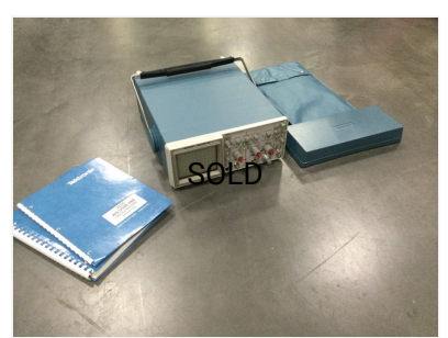
Tektronix AN/USM-488 Oscilloscope Pennsylvania