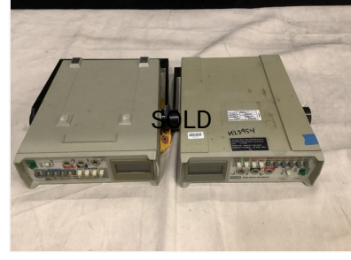
(2) Fluke 8050A Digital Multimeters Nevada