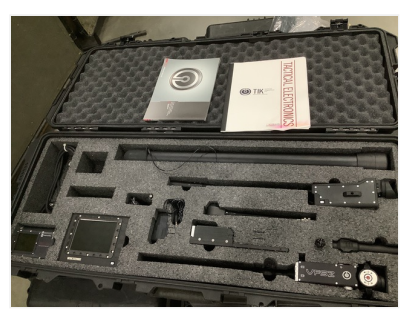
Tactical Electronics Inspection Kit Pennsylvania US $150