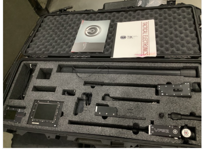
Tactical Electronics Inspection Kit Pennsylvania US $200