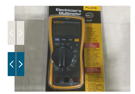
(13) Fluke 117 True RMS Multimeters Pennsylvania US $380