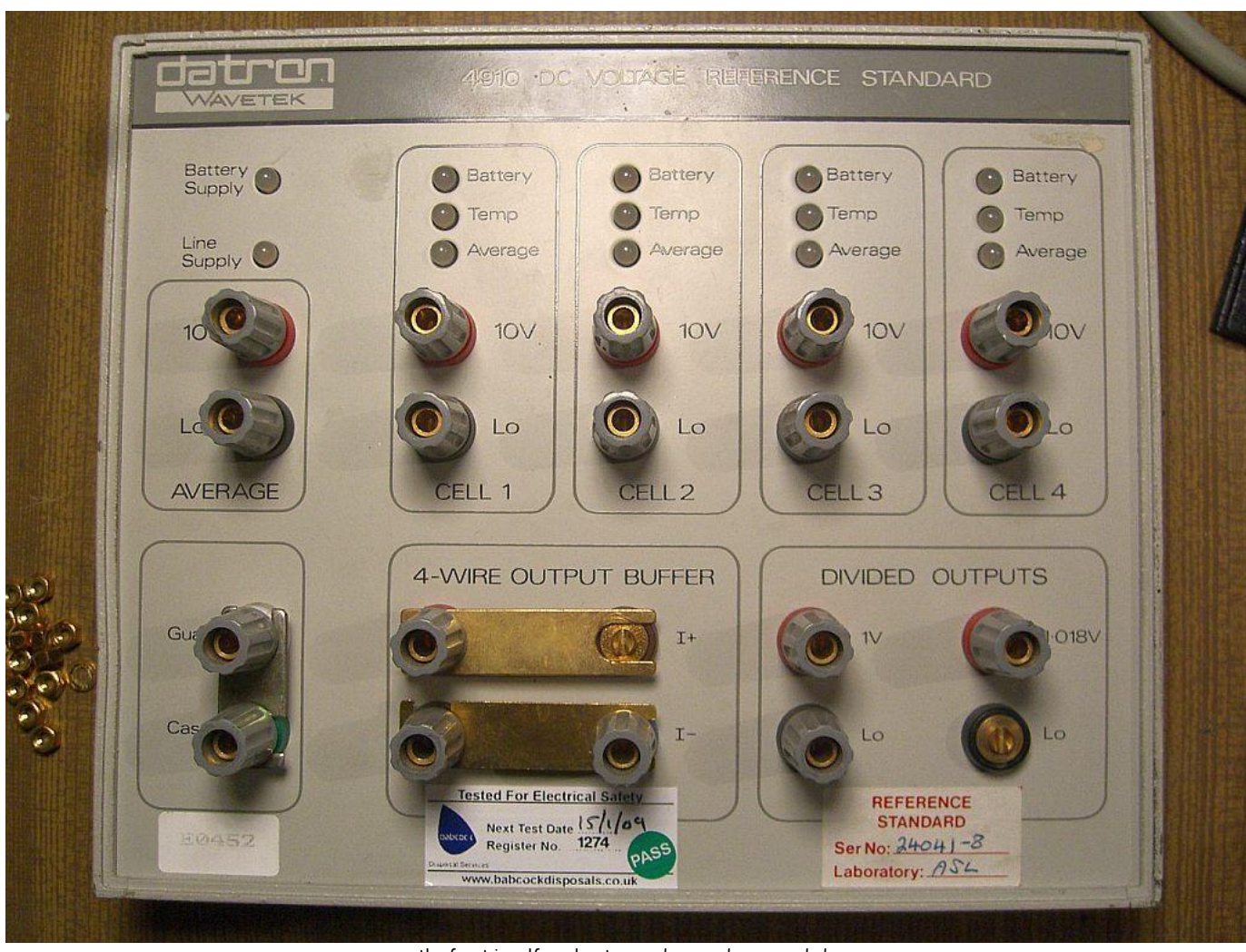
the front is self-explanatory and no words are needed.