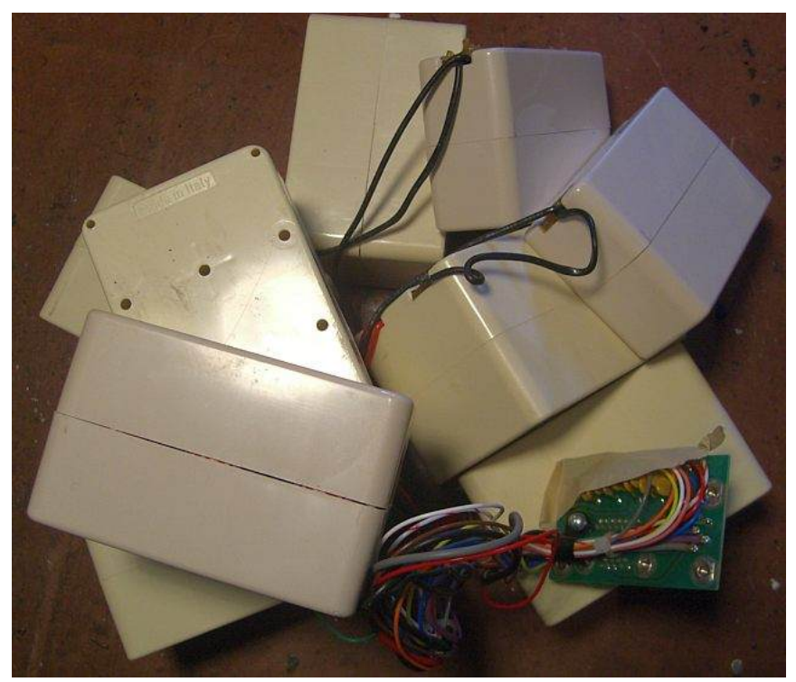
It should probably have been the first batteries and they are now dead and a case for hazardous waste.