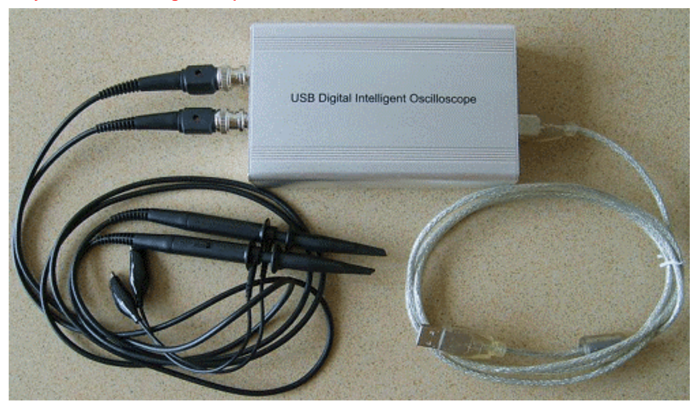
Embest DSO2300 USB Oscilloscope