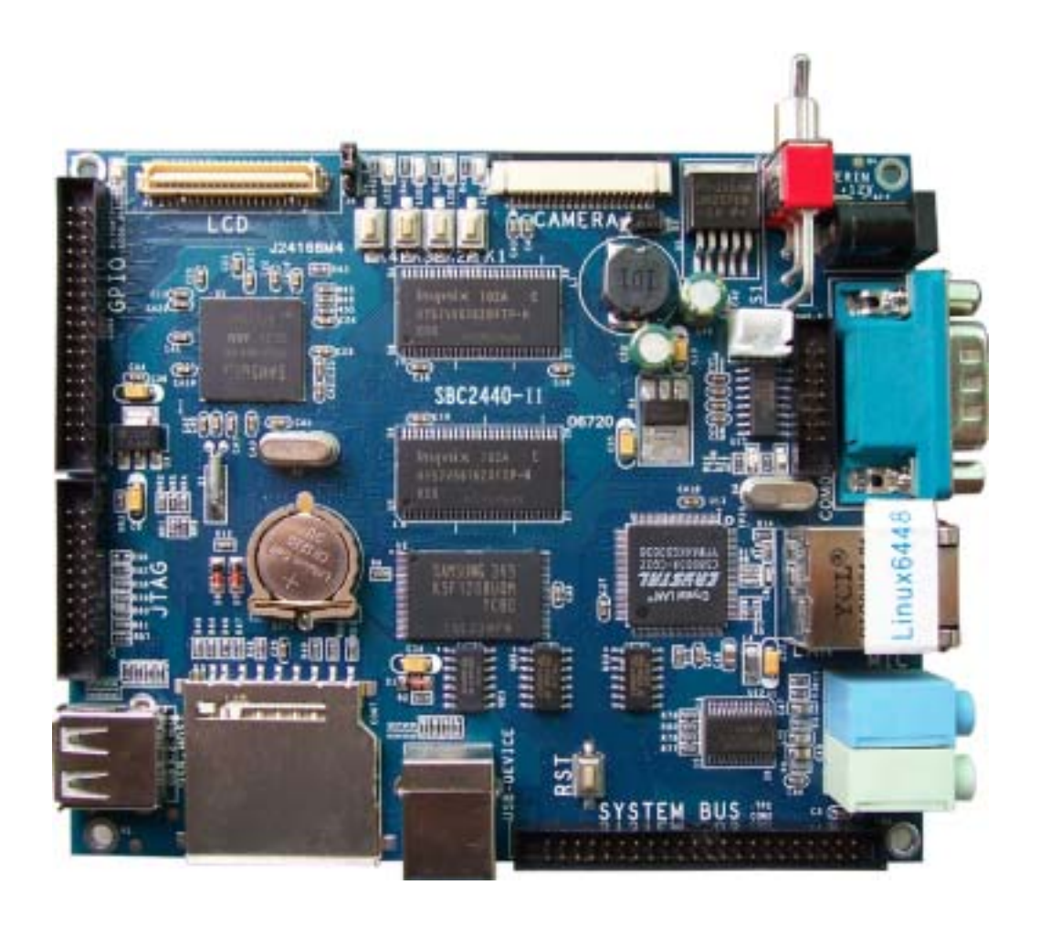
Embest SBC2440-II Single Board Computer