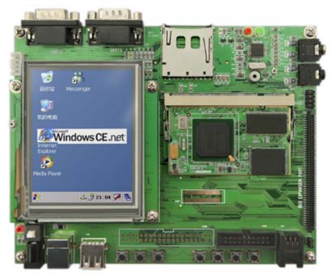
Embest XScale PXA270 Evaluation Board