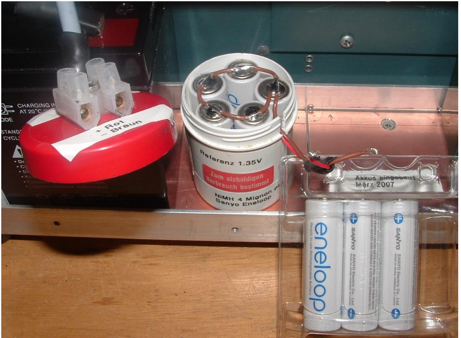
works quite well as a 1.35V battery replacement