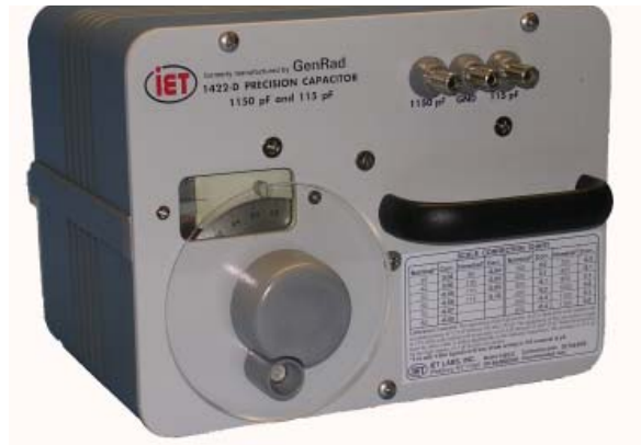
Model 1422 Precision Capacitor

A worm drive is used to obtain high precision of setting. To avoid eccentricity, the shaft and the worm are accurately machined as one piece. The worm and worm wheel are also lapped into each other to improve smoothness. The dial end of the worm shaft runs in a self-aligning ball bearing, while the other end is supported by an adjustable spring mounting, which gives positive longitudinal anchoring to the worm shaft through the use of a pair sealed, self-lubricating, preloaded ball bearings. Similar pairs of preloaded ball bearings provide positive and invariant axial location for the main or rotor shaft. Electrical connection to the rotor is made by means of a silver-alloy brush bearing on a silver-overlay drum to assure a low-noise electrical contact.