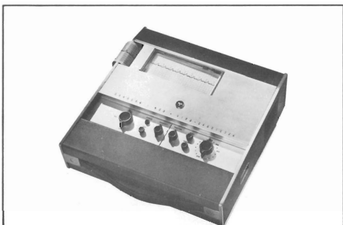
Because of its design excellence, Sanborn's new "500 Viso-Cardiette" is one of 19 products selected for exhibition in Los Angeles by the Wescon Industrial Design Awards Committee. The compact electrocardiograph was one of 132 entries in this competition.

from Loveland, magnetic tape recorder systems by Sanborn, three new high voltage power supplies from Harrison, Dymec data plotting systems, the HP spectrum analyzer, cesium beam standard, and some unique new plug-ins for the 175A scope.