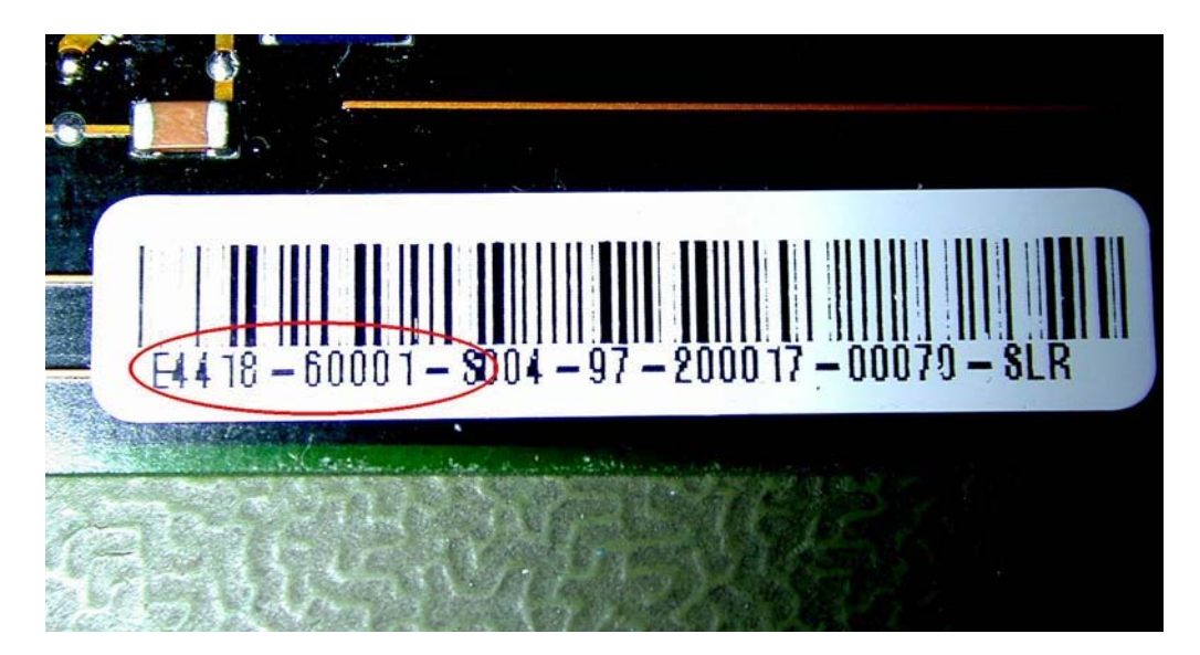
Figure 1. Label Example