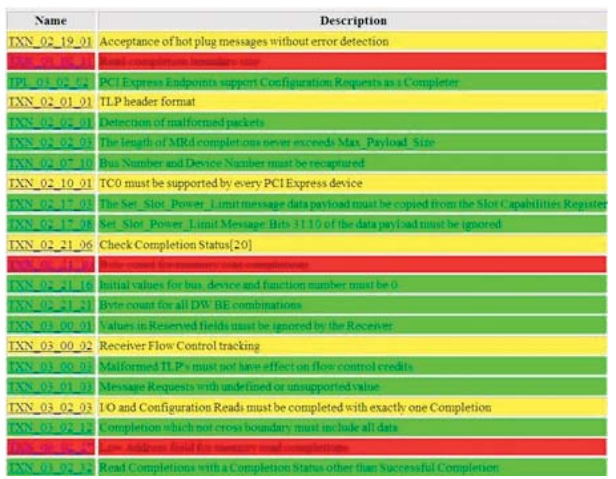
HTML Compliance Report