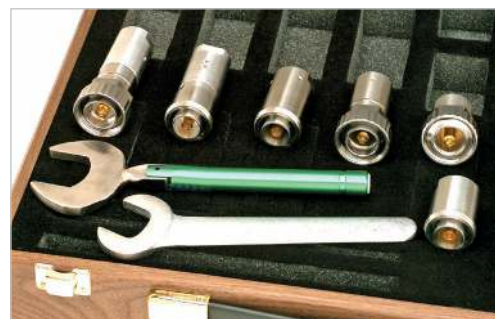
Mechanical calibration kits