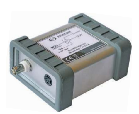
Picotest J2111A Current Injector