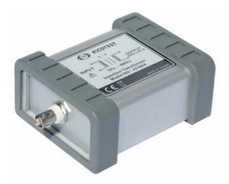
Picotest J2100A Injection Transformer