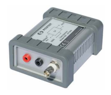
Picotest J2120A Line Injector