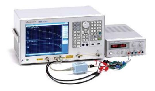
Pomona 3787-C-18 test lead (connected to gain-phase receiver ports) Pomona 2886 BNC breakout (connected to 0017CC)

Picotest web page: http://www.picotest.com