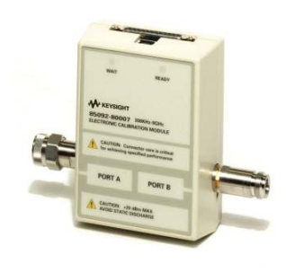
Electronic calibration (ECal) modules