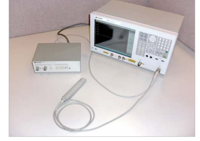
41800A and E5061B