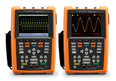
World's first VGA display handheld oscilloscope with two isolated channels