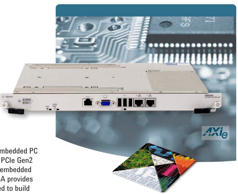
Challenge the Boundaries of Test Agilent Modular Products

Chassis slot compatibility: AXIe 1.0 secondary hub-slot (slot #1 in the M9502A and M9505A)