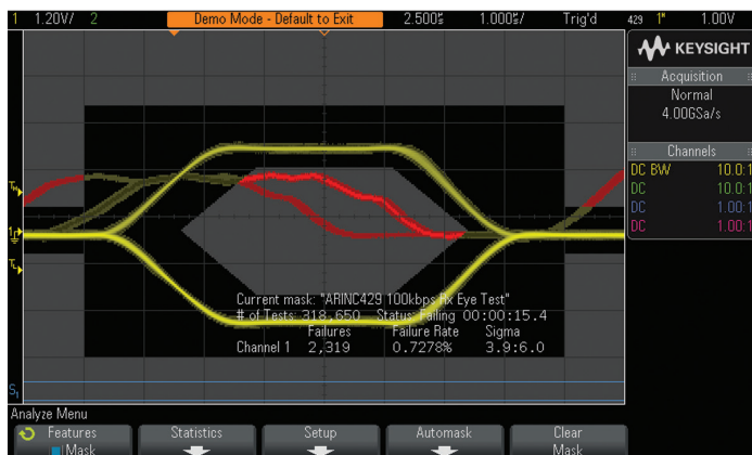
Figure 2. Testing the signal integrity of a differential ARINC 429 serial bus using eye-diagram mask testing.

The upper, lower, and middle regions that define the waveform "keep-out" area of the ARINC 429 mask shown in Figure 2 are based on published ARINC 429 minimum and maximum input amplitudes, rise/fall times, and clock tolerance specifications.