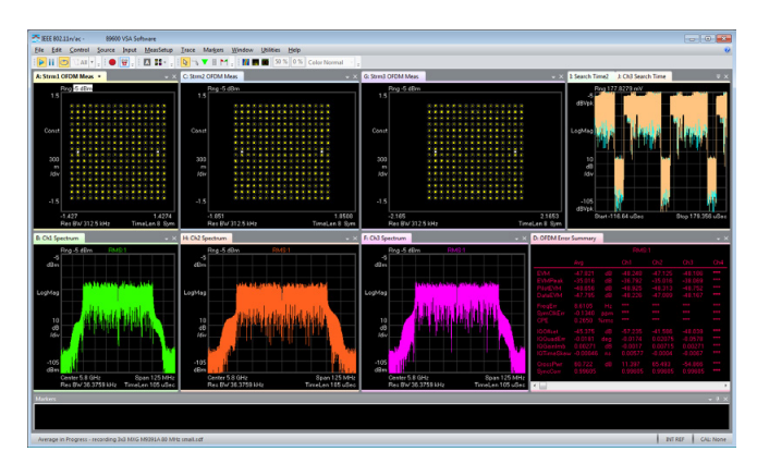
Figure 2. 3-channel 802.11ac analysis using Keysight's 89600 VSA software.

The M9391A supports input signals from 1 MHz to 6 GHz, easily covering the 802.11ac frequency bands and enables scalable deployment, with 1 to 4 channels configurable in a single 18-slot PXI chassis. Keysight's 89600 VSA software controls the M9391A PXI VSAs and provides the measurement algorithms for MIMO WLAN transmitter testing. The 89600 VSA software can be controlled programmatically via the .NET interface for fast automation required in many validation test scenarios.