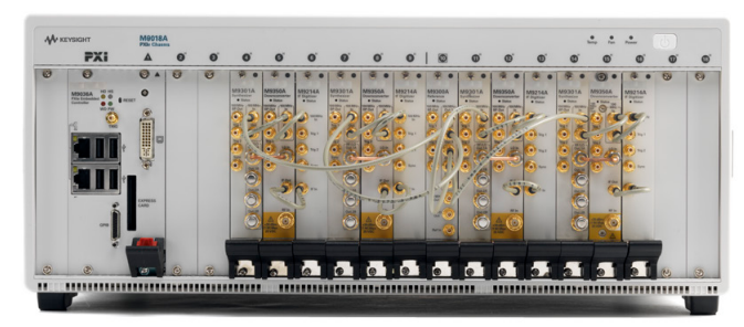
Figure 1. 4-channel M9391A PXIe vector signal analyzer configuration

Many test solutions today do not support the wide bandwidths or multi-channel capabilities required by 802.11ac designers. They may also lack a full-featured analysis package that includes hardware control and standards-based 802.11ac modulation quality measurements.