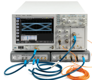
86100D/86107A/86105D + N1070