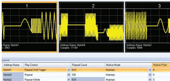
Figure 1. BenchLink Waveform Builder Pro sequencing menu.

The following is an example that uses Keysight BenchLink Waveform Builder Pro to build a new signal from a library of arbs.