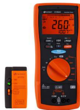
Figure 4. U1117A IR-to-Bluetooth Adapter enables wireless remote testings with the U1450A/U1460A series