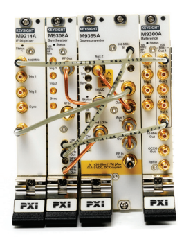
M9393A with standard cabling