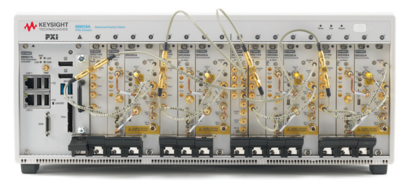
Cable connections for four M9393As in a single M9018A chassis.

Up to four M9393As can be installed in a single M9018A 18-slot PXIe chassis. The M9393As also share a single M9037A PXIe embedded controller or external PC.