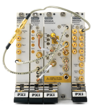
M9393A with alternative cabling to maximize M9300A 100 MHz outputs