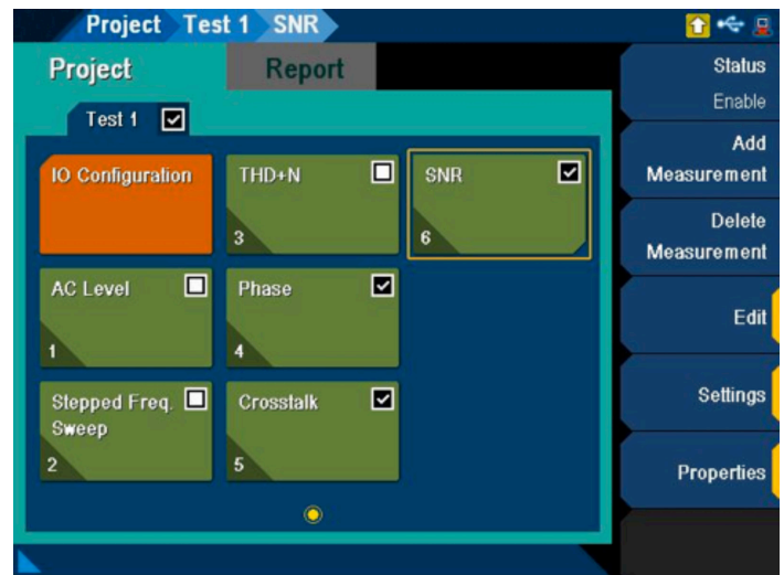
Figure 4. Modify the default setting and test report content to fit your measurement requirement.

Press [Return] to go back to the test sequence on the main screen. Continue modifying each of the settings for the other measurements to suit your test application and indicate what content to included in the test report. The main screen of U8903B should look like Figure 4.