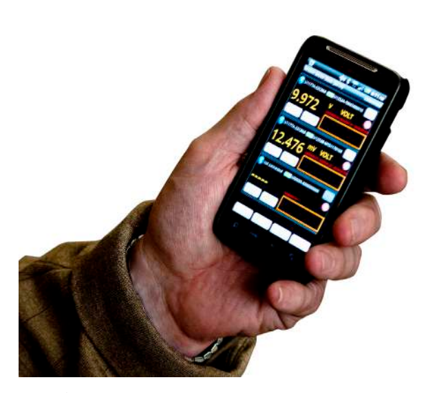
Figure 6. Make measurements with the Keysight Mobile Meter via an Android smart phone

Keysight Mobile Meter is a free Android application software that allows an Android device to connect, control and perform up to 3 multimeter measurements. Without the need to be physically present at various points, users can now extend their reach to two or three places. This solution allows you to make measurements from a safe distance, eliminates the need to walk back-and-forth between measure target and control points, and monitors multiple measurements simultaneously. Achieve higher work productivity when you use the U1177A with your Keysight handheld digital multimeters.