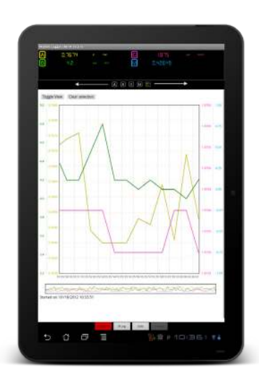
Figure 4. Data logging with Keysight Mobile Logger software.