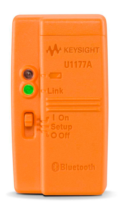
Figure 3. The U1177A as illustrated