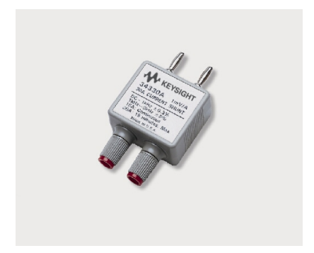
34330A 30A Current Shunt