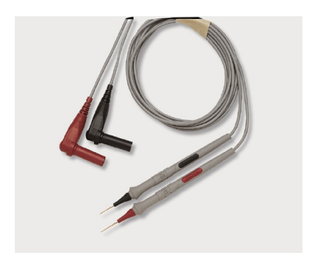
34133A Precision Electronics Test Leads