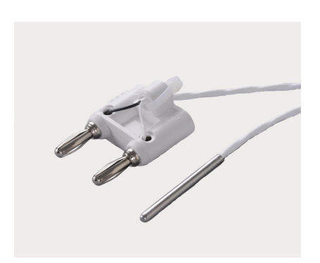
E2308A Thermistor Probe