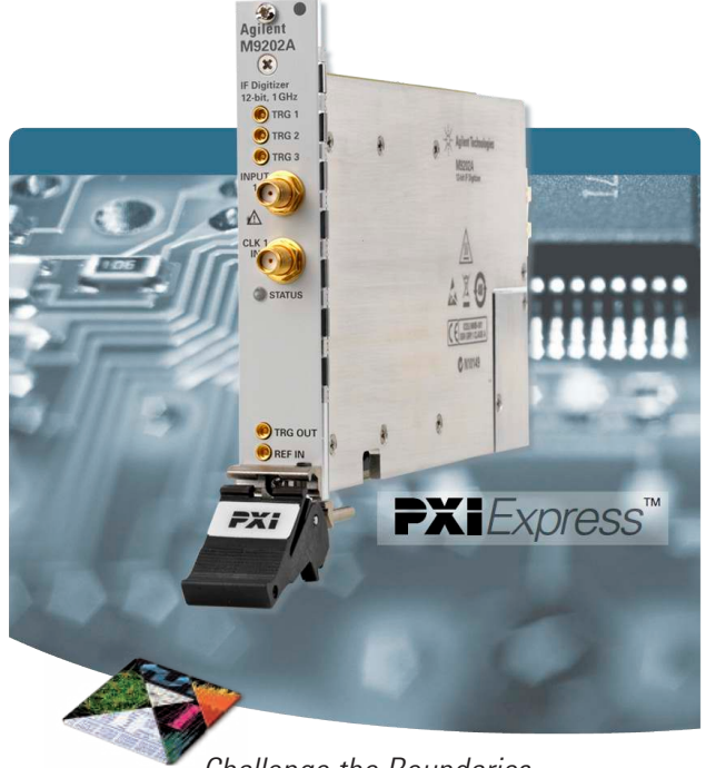
Challenge the Boundaries Agilent Modular Products

The M9202A is a single-slot 3U PXIe Wideband IF Digitizer running at 2 GS/s, with up to 1 GHz instantaneous analog bandwidth and utilizing a large DDR3 memory. The M9202A features a Xilinx Virtex-6 FPGA that can implement different functionalities depending on which firmware option you choose. The BAS option provides basic digitizer functionality (signal capture, storing of data, transfer of data, etc), whereas the DDC option, in addition to basic digitizer functionality, implements a real-time digital down-conversion (DDC) algorithm in the 300 MHz to 700 MHz band, enabling improved analog performance and reducing data upload time. Thanks to its PXI Express backplane connection, the M9202A supports continuous data streaming to disk.