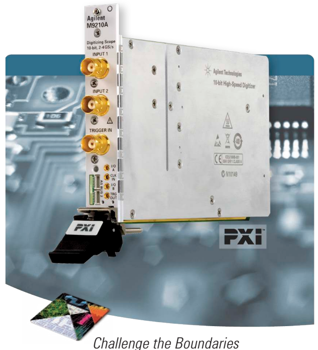
Agilent Modular Products

The M9210A is a single-slot 3U PXI-Hybrid high-speed Digitizing Scope featuring 2 channels with 1.4 GHz/300 MHz (50 \Omega/1 M \Omega input) analog bandwidth and up to 4 GS/s real-time sampling rate. The M9210A Digitizing Scope comes with on-board memory of up to 512 MSamples. Making it the best alternative to the Agilent VXI E1428.