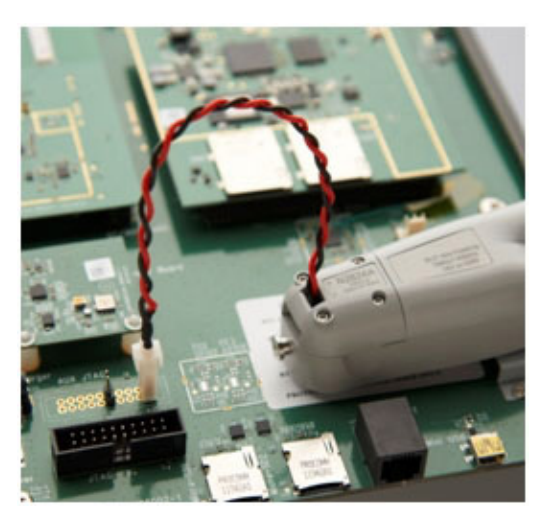
Figure 4 The supplied Make-Before-Break (MBB) connectors allow you to quickly probe multiple locations on your DUT without having to solder or unsolder the leads.

The probe offers an innovative method of connecting the probe to your DUT. The supplied Make-Before-Break (MBB) connectors allow you to quickly probe multiple locations on your DUT without having to solder or unsolder the leads. The MBB header may be mounted on your target board or wired out of the DUT. It fits into standard 0.1" spacing thru-holes for 0.025" square pins. Users should plan their PCB layouts accordingly. The MBBs are a great way to easily connect and disconnect across multiple locations on the target board without interrupting the circuit under test.