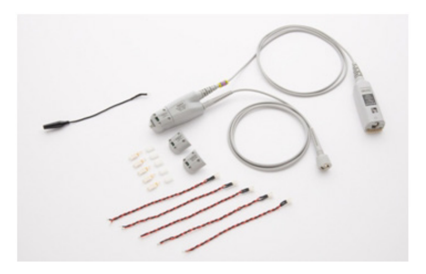
Figure 3 The new N2820A/21A AC/DC current probes offer the industry's highest sensitivity among oscilloscope current probes.

Keysight's N2820A 2-channel high sensitivity current probe comes with two parallel differential amplifiers inside the probe with different gain settings, where the low gain side allows you to see the entire waveform or the "zoom out" view of the waveform and the high gain amplifier provides a "zoom in" view to observe extremely small current fluctuations, such as a mobile phone's idle state. The N2820A/21A current probes are optimized for measuring the current flow within the DUT to characterize sub-circuits, allowing the user to see both large signals and details on fast and wide-dynamic current waveforms.