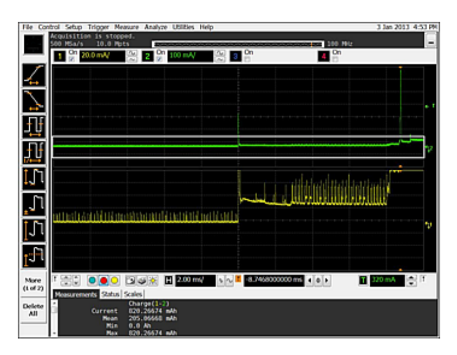
Figure 5 Keysight's Infiniium and InfiniiVision oscilloscopes provide an area under the curve measurement (Charge), where you can easily calculate the integrated current consumptions in Ah (Ampere x Hour) over time.

Now with the N2820A/21A current probes, engineers in battery-powered product testing are able to see the details and the big picture on dynamic current waveforms like never before with traditional clamp on probes.