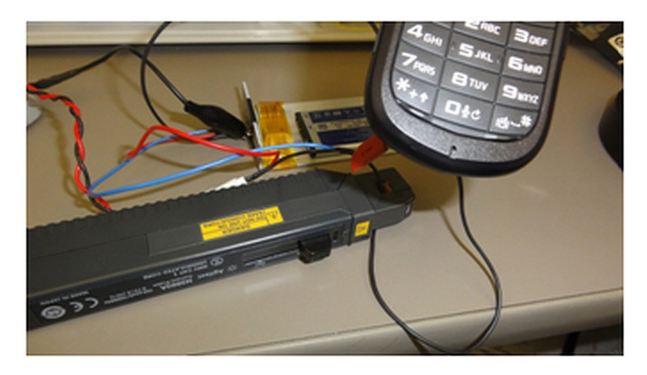
Figure 2 A simple way to measure a current with an oscilloscope is to use a clamp-on type current probe such as Keysight's 1147B or N2893A.

Also, for a more accurate measurement, one would occasionally degauss the probe to remove residual magnetism from the probe core and compensate for any DC offset of the clamp-on current probe. This extra calibration procedure makes the clamp-on current probe cumbersome to use.