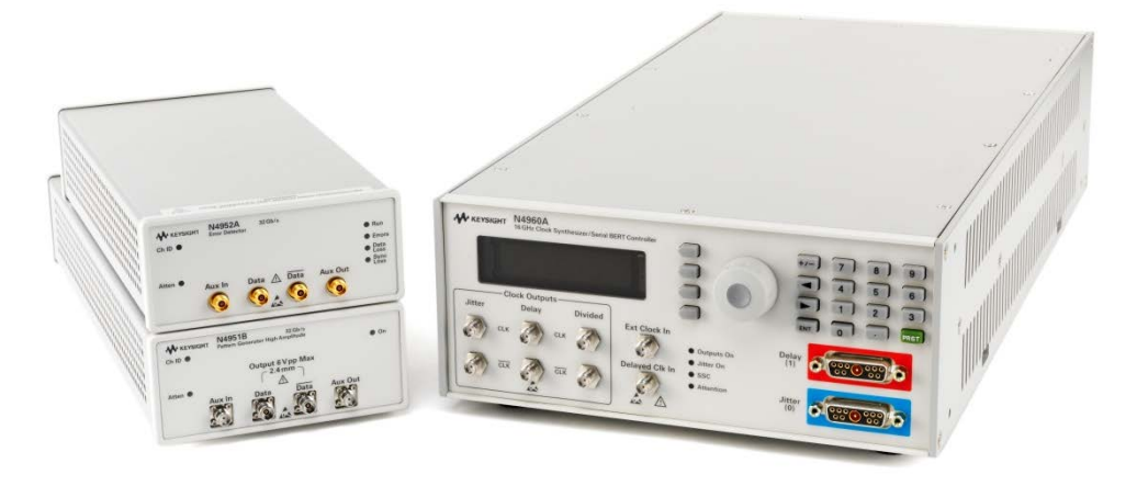
Figure 1. N4960A Serial BERT