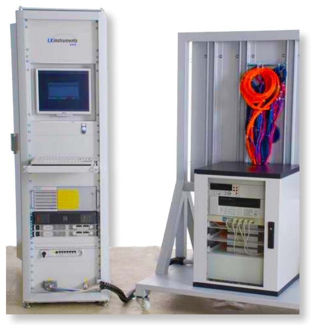
Figure 1. The LXinstruments Burn-In Test System with the Keysight 34980A Switch/Measure Unit.

The solution developed by LXinstruments is to create a modular multiplexed architecture, based on the Keysight 34945A breadboard module for the 34980A Multifunction Switch/Measurement Unit, which allows the DUT's to be switched between common power supplies. This solution is fully scalable allowing it to cater to a varying number of DUTs, reducing the cost and physical space required.