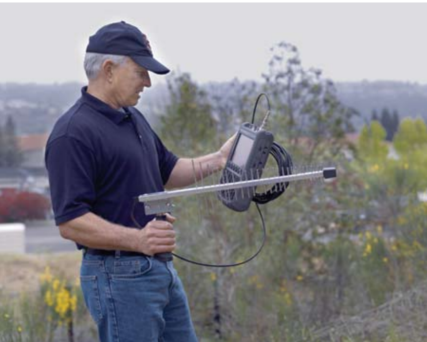
Figure 1: Agilent's handheld FieldFox microwave spectrum analyzers offer precise measurements up to 26.5 GHz and can withstand your toughest working conditions.

The process of identifying undesired signals may involve uncovering the type of signal, including: its duration of transmission, number of occurrences, carrier frequency and bandwidth, and possibly even the physical location of the interfering transmitter. If the system operates in full-duplex mode, it may also be necessary to examine the uplink and downlink frequency channels for signs of interference.