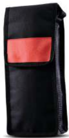
U1175A carrying case