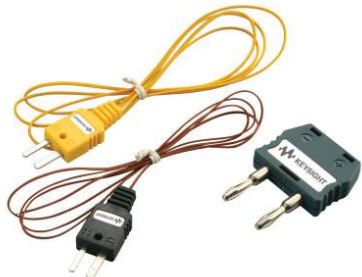
U1180A thermocouple adapter/lead kit