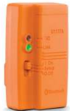
U1177A infrared (IR)-to-Bluetooth® adapter