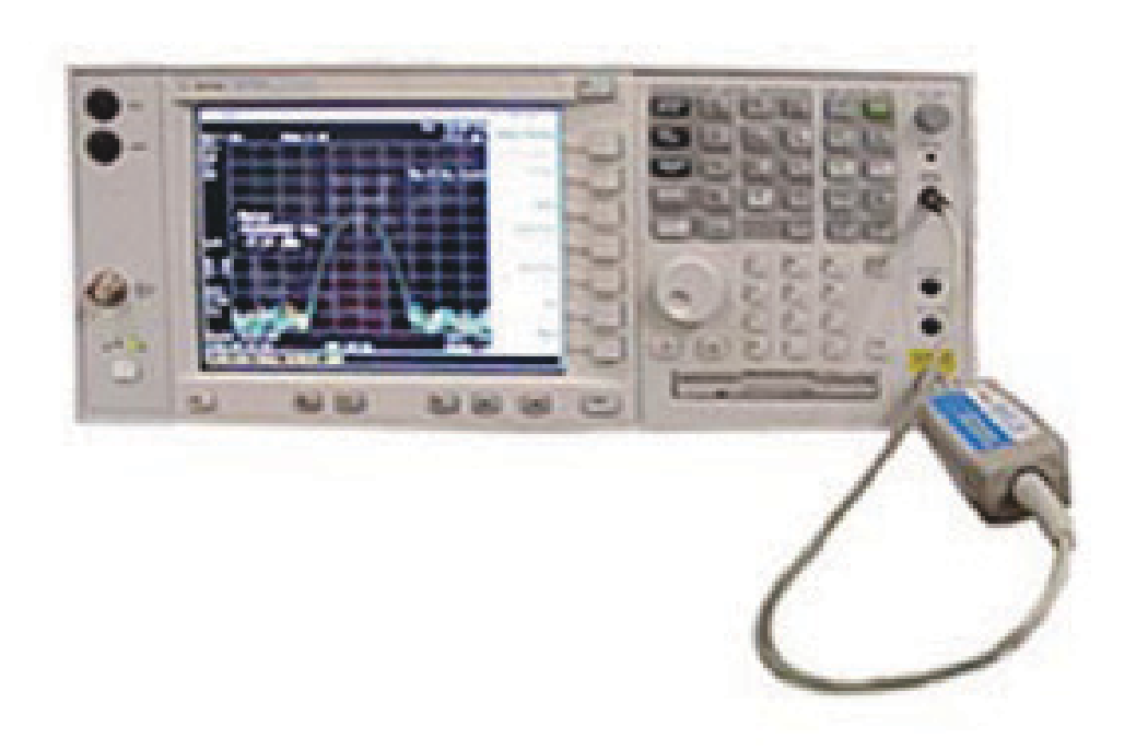
Figure 1 Front Panel