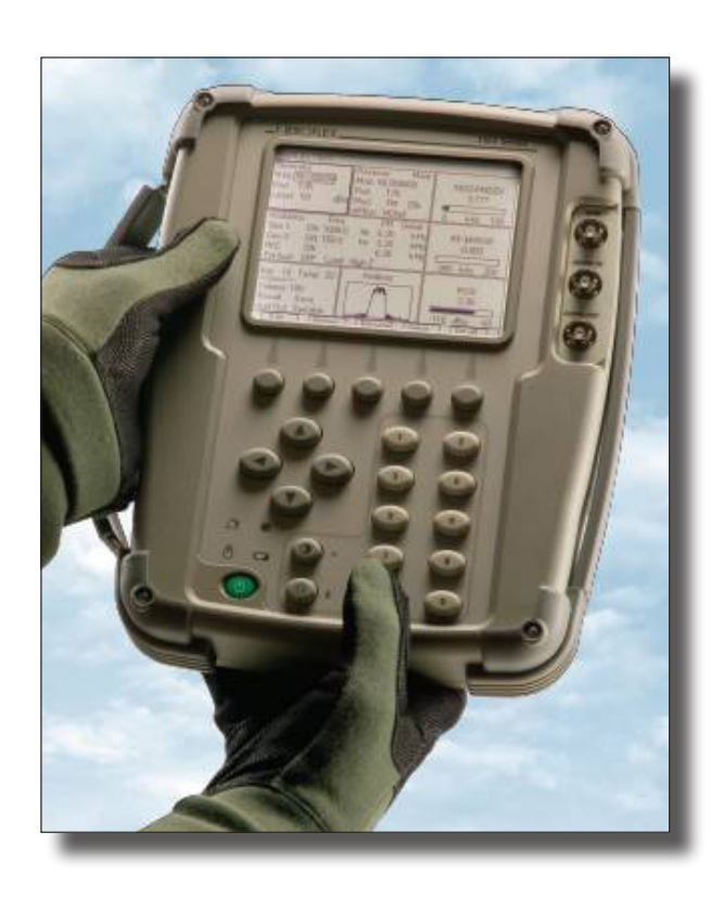
The 3515 is a first-line radio test set designed to verify that portable radios, man-pack radios, vehicle and aircraft radios are mission ready.

The most important thing we build is trust