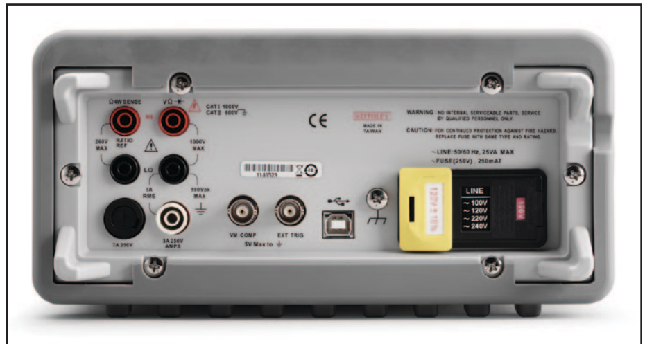
Model 2100 rear panel

AC CMRR: 70dB (for 1kΩ unbalance LO lead). POWER SUPPLY: 120V/220V/240V. POWER LINE FREQUENCY: 50/60Hz auto detected. POWER CONSUMPTION: 25VA max. DIGITAL I/O INTERFACE: USB-compatible Type B connection. ENVIRONMENT: For indoor use only. OPERATING TEMPERATURE: 5° to 40°C. OPERATING HUMIDITY: Maximum relative humidity 80% for temperature up to 31°C, decreasing linearly to 50% relative humidity at 40°C. STORAGE TEMPERATURE: –25° to 65°C. OPERATING ALTITUDE: Up to 2000m above sea level. BENCH DIMENSIONS (with handles and feet): 112mm high × 256mm wide × 375mm deep (4.4 in. × 10.1 in. × 14.75 in.). WEIGHT: 4.1kg (9 lbs.). SAFETY: Conforms to European Union Directive 73/23/ECC, EN61010-1. EMC: Conforms to European Union Directive 89/336/EEC, EN61326-1. WARRANTY: One year.