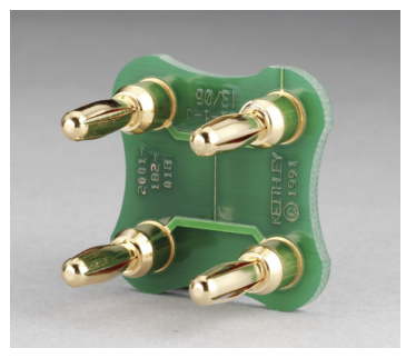
Figure 1: Model 8610 low thermal shorting plug

The Keithley Instruments Model 8610 low thermal shorting plug provides a very low thermal offset short at front or rear input terminals. The Model 8610 consists of four gold-plated banana plugs that are mounted to a one-inch-square circuit board. The circuit board is interconnected to provide a short-circuit between all input terminals.