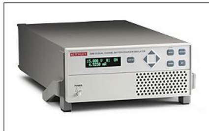
Keithley Model 2306-VS