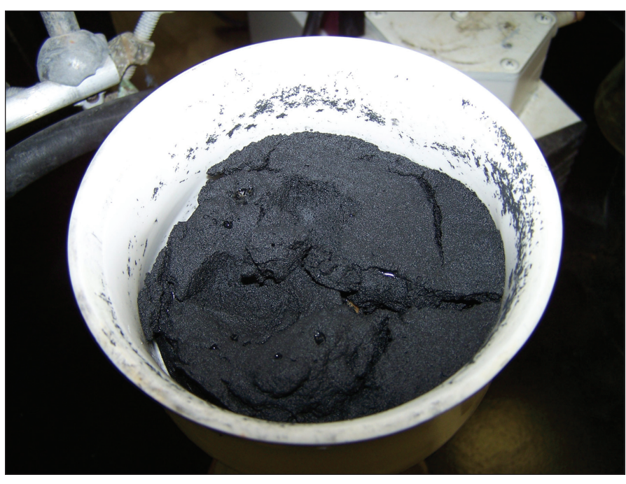
Figure 1. Carbon nanotubes (CNTs) in bulk.

Nanomechanical testing has become a popular way of determining quantitative, small volume mechanical properties. Conceptually, nanoindentation is a relatively straightforward technique in which an