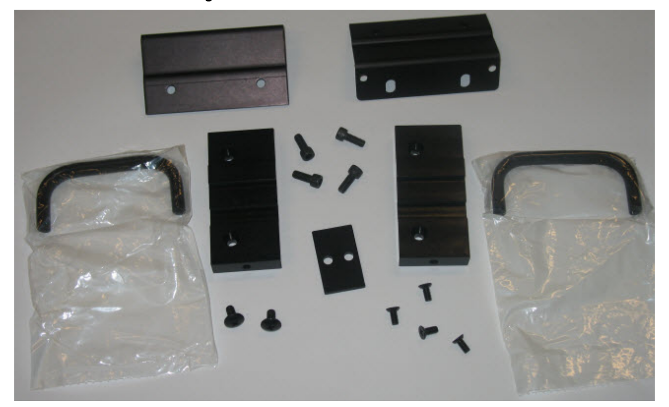
Figure 3: Model 2290-5 rack mount kit hardware

The next figure shows the hardware that you will receive with your rack mount kit. You can use this figure, the Parts list (on page 1), and the previous figures to ensure that you have all of the necessary hardware to mount your instruments.