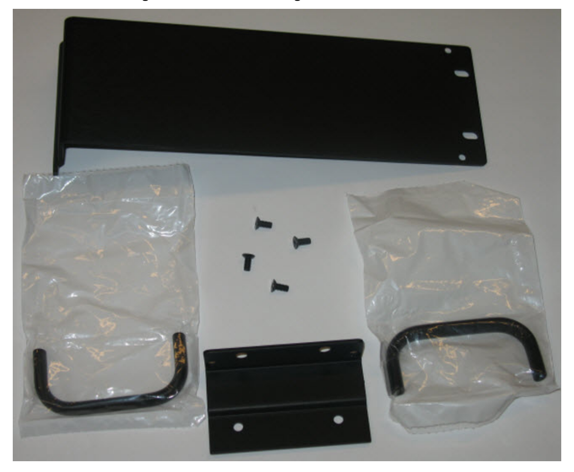
Figure 3: Model 2290-5 single rack mount kit hardware

The next figure shows the hardware that you will receive with your rack mount kit. You can use this figure, the <u>Parts list</u> (on page 1), and the previous figures to ensure that you have all of the necessary hardware to mount your instruments.