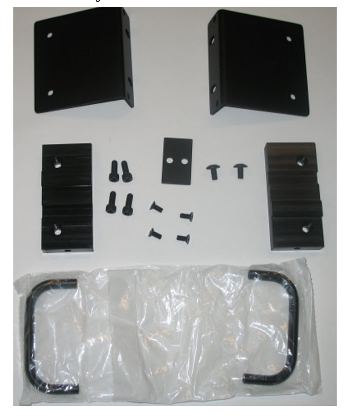
Figure 3: Model 2290-10 rack mount kit hardware

The next figure shows the hardware that you will receive with your rack mount kit. You can use this figure, the Parts list (on page 1), and the previous figures to ensure that you have all of the necessary hardware to mount your instruments.