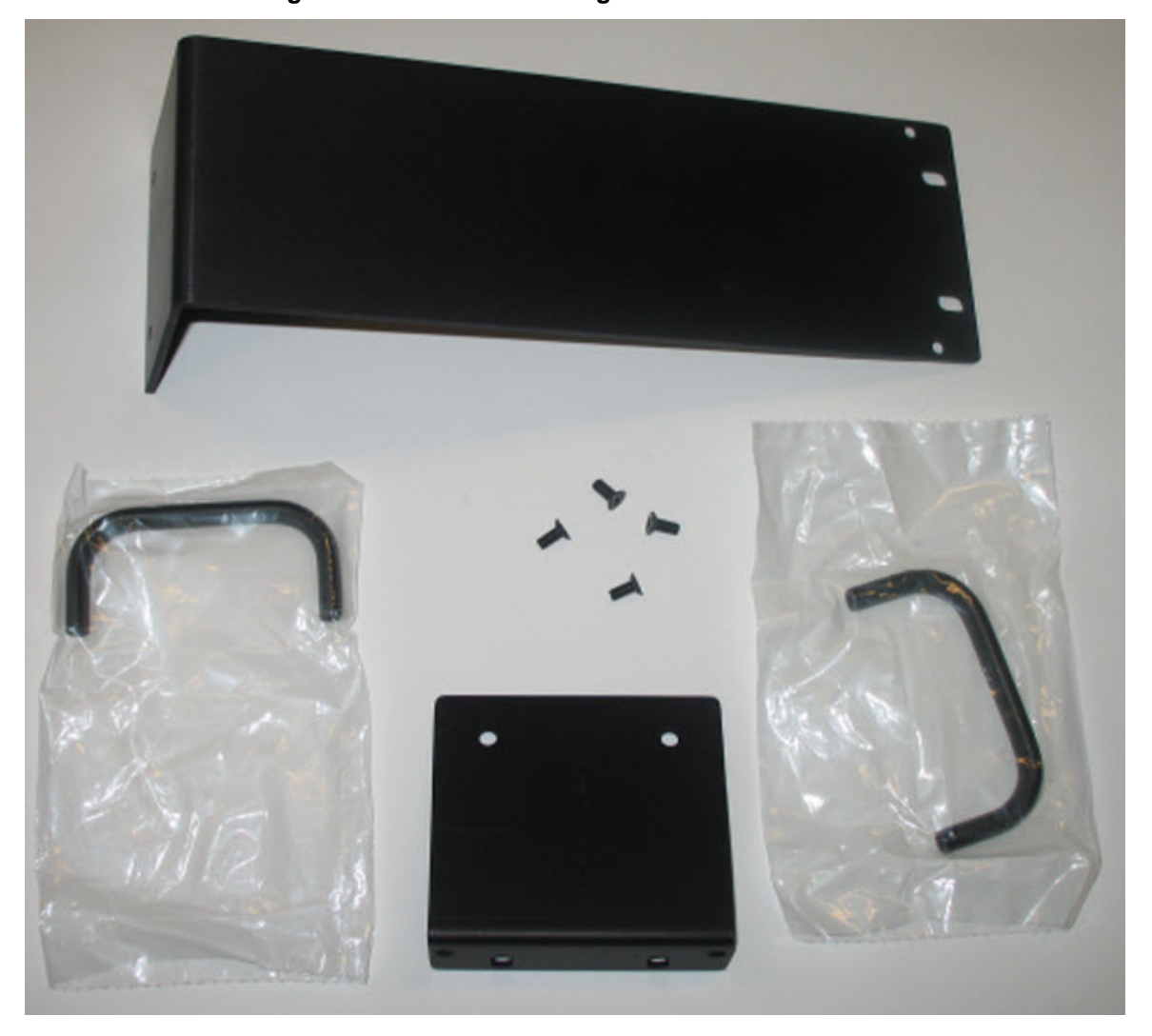
Figure 3: Model 2290-10 single rack mount kit hardware

The next figure shows the hardware that you will receive with your rack mount kit. You can use this figure, the Parts list (on page 1), and the previous figures to ensure that you have all of the necessary hardware to mount your instruments.