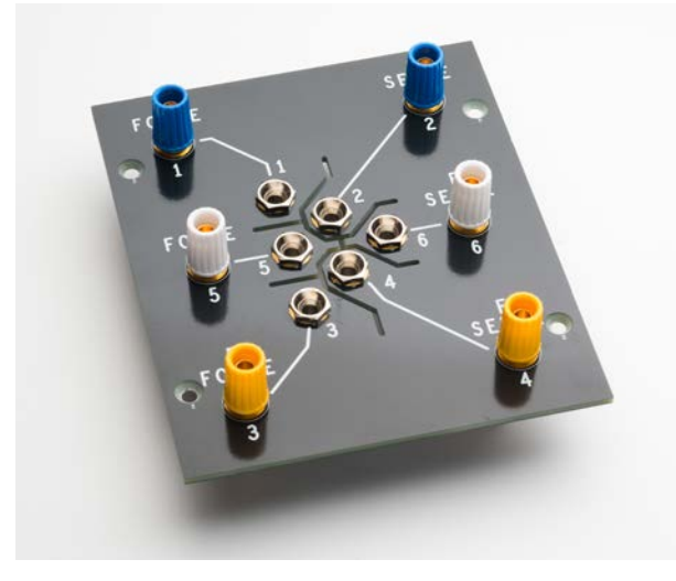
Figure 1: Model 8010-DTB-CT curve tracer test board

For device connection and measurement considerations using the 8010-DTB-CT, refer to the Model 8010 High Power Device Test Fixture User's Manual.