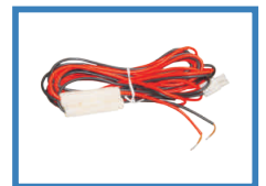
DC Power cable