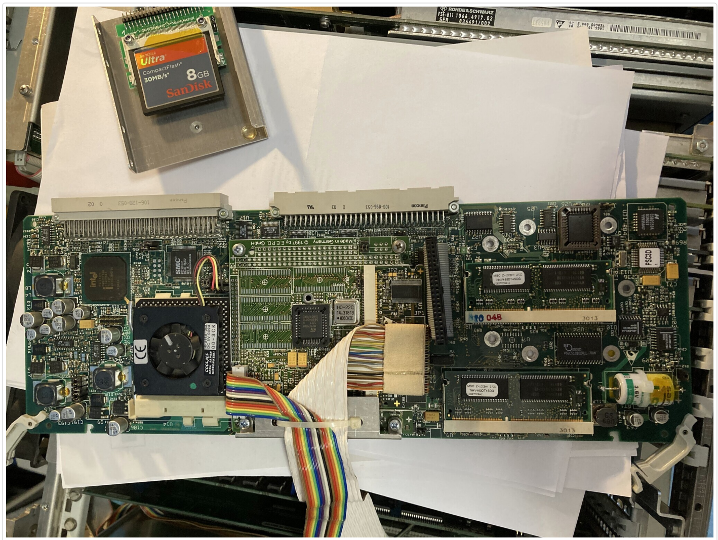
(https://groups.io/g/Rohde-and-Schwarz/attachment/3385/0/FSIQ, IMG 3285.JPG)

Translated with www.DeepL.com/Translator (free version)