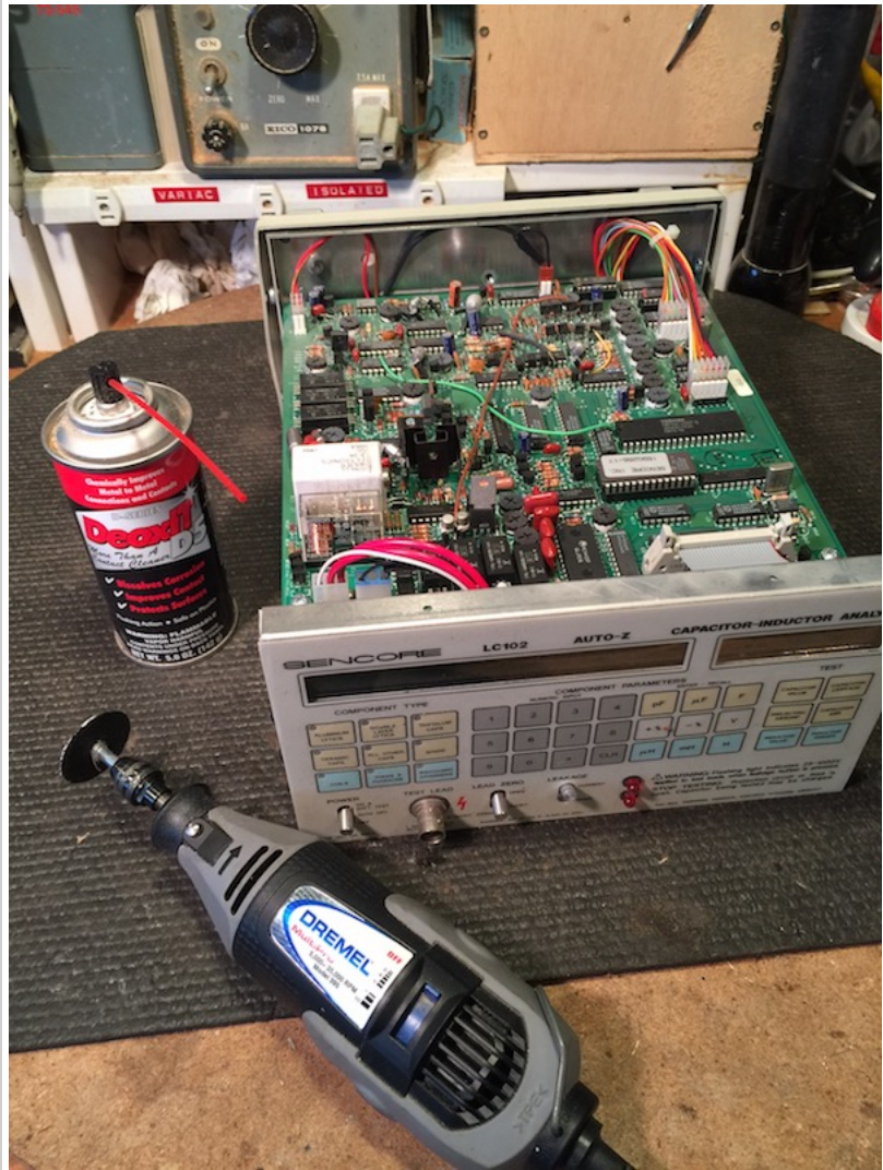
sencore3.jpg [ 191.95 KiB | Viewed 912 times ]