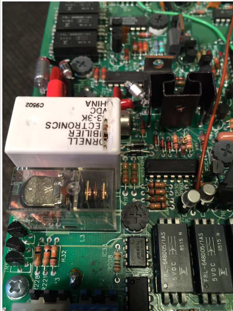
sencore2.jpg [ 230.88 KiB | Viewed 912 times ]

The only tools needed. I gave the contacts a squirt of De-Oxit, cleaned things up and put a strip of tape over the opening.