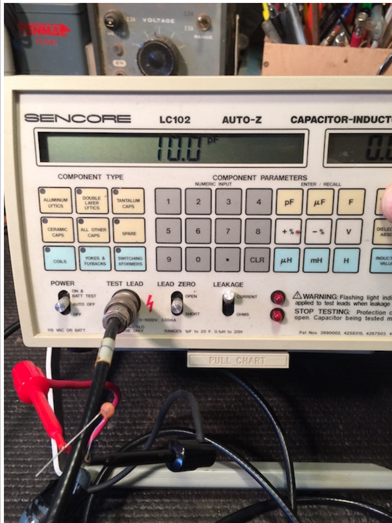
sencore5.jpg [ 205.33 KiB | Viewed 912 times ]