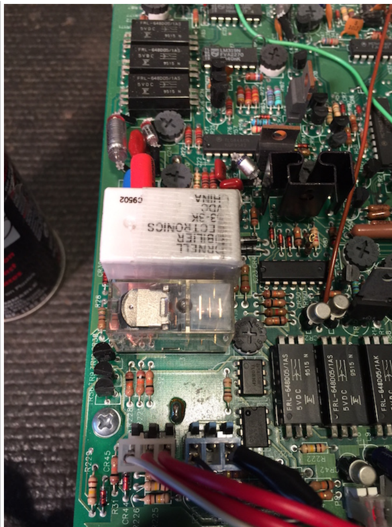
sencore4.jpg [ 254.75 KiB | Viewed 912 times ]