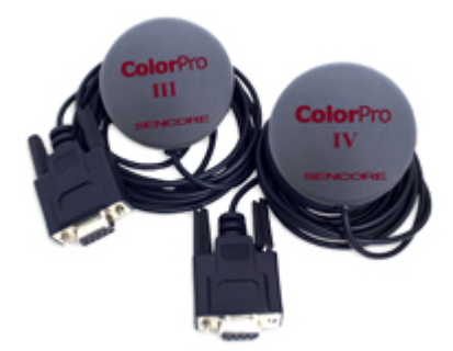
CP5000 ColorPro All-Display Color Analyzer (also available with USB connectors)