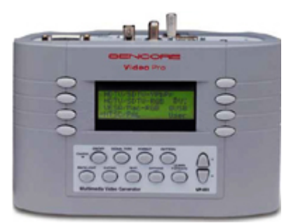
A VideoPro Generator from the VP40x family (VP400, VP401, VP402, or VP403)

Call Today! 1-800-736-2673 or 1-605-339-0100