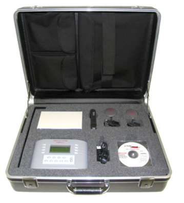
CC307 Video tool suite case