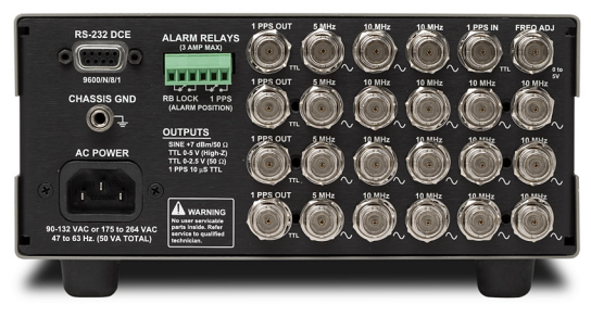
FS725 rear panel (with Opt. 03)